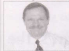
Independent Insurance Agent